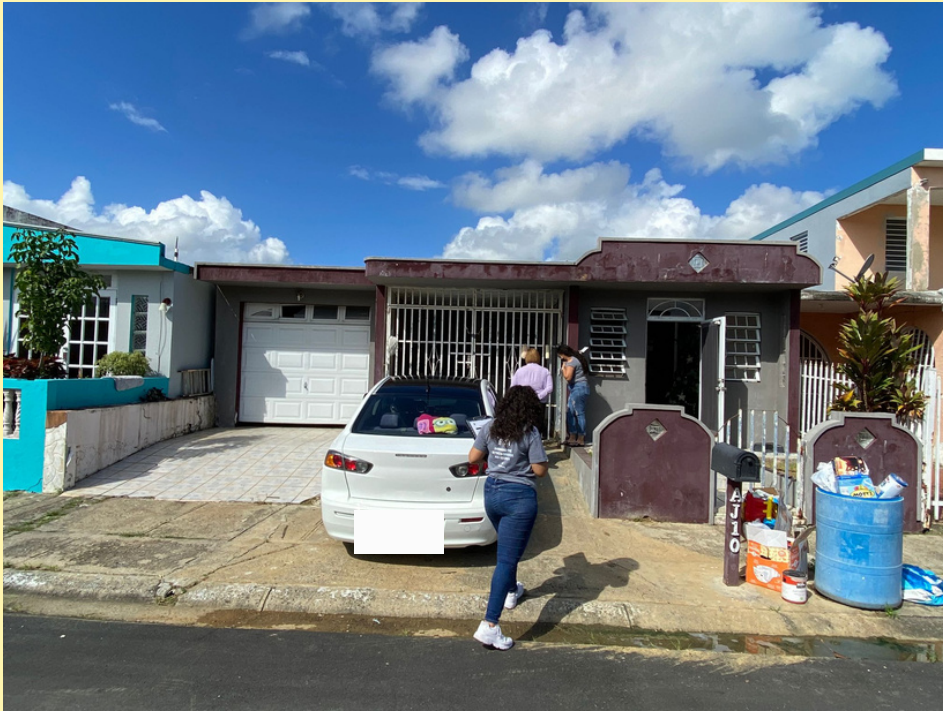
Front of the house