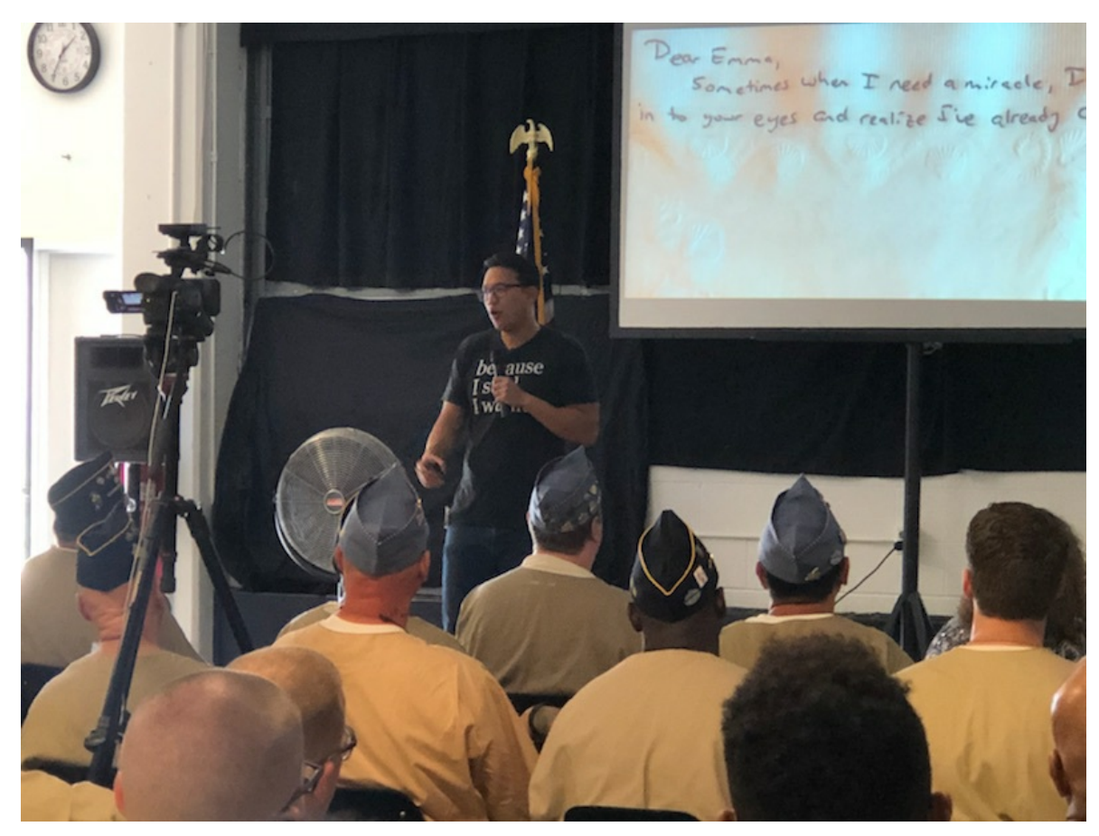
CLICK HERE TO DONATE

Due to your continued support, we are able to offer new and exciting programs such as this one. Please consider giving a gift today.