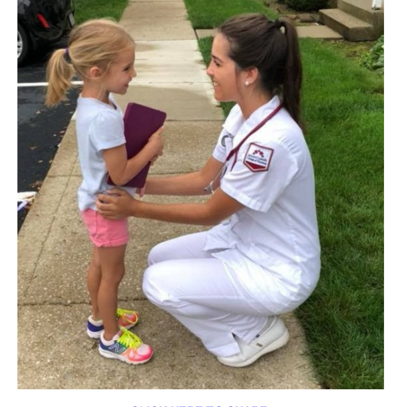
CLICK HERE TO SHARE A COMMENT WITH DEIDRE ON FACEBOOK