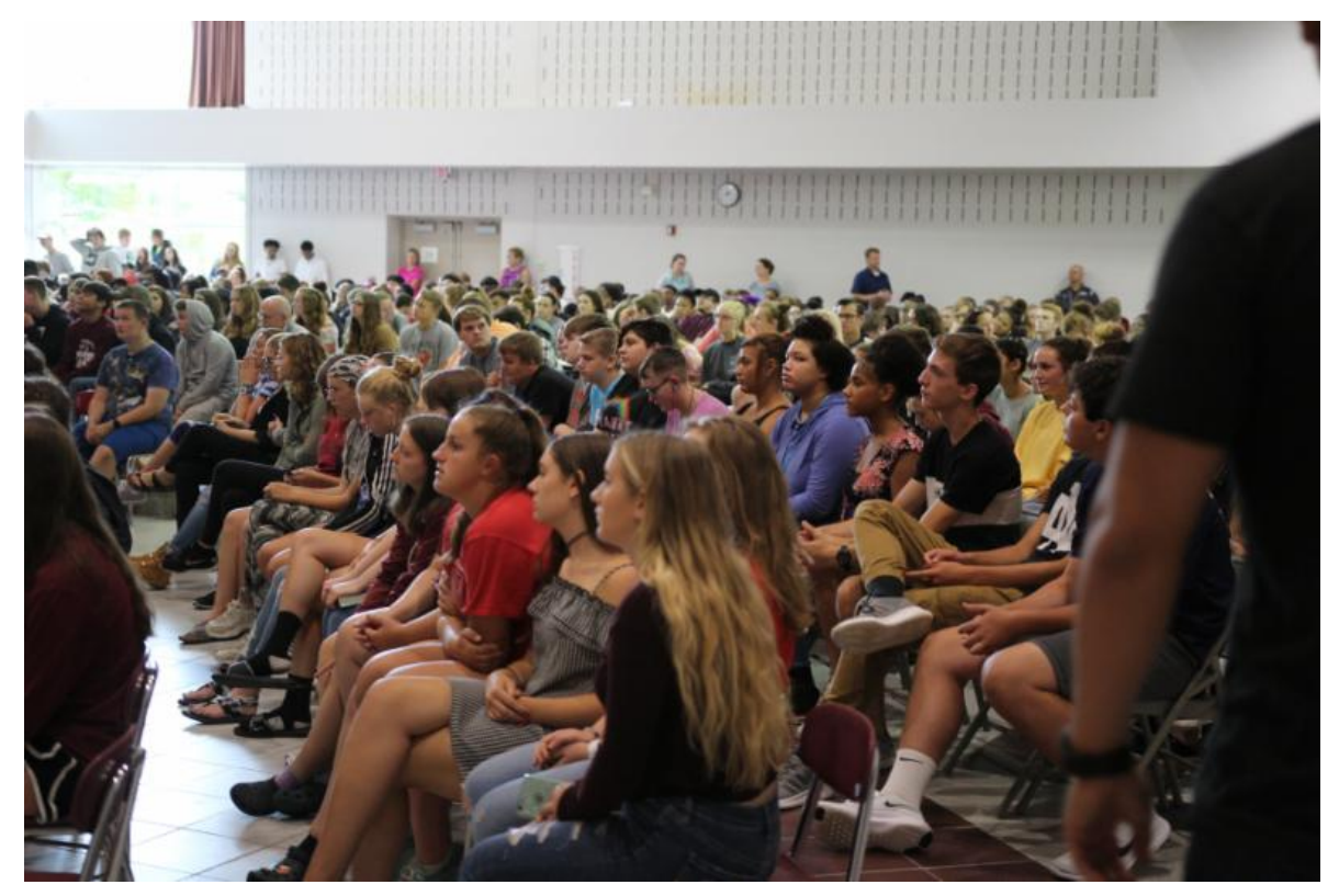
August 2018 Chapter Launch at Woodridge High School in Peninsula, Ohio.