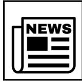
Magazines and Newspapers