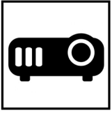
White Board or Projector